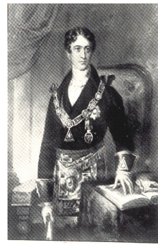
JOHN GEORGE, FIRST EARL OF DURHAM, G.C.B.

Penshaw Monument is a landmark known to all of us and it is often viewed with interest by visitors to the region. Its position on a hill top is a guide to how close we are to home. How many of us, however, know its history especially the Masonic significance of the monument? It is of course a memorial to the Earl of Durham, John George Lambton (pictured top-right).