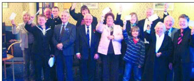
All the recipients gathered to show off their cheques